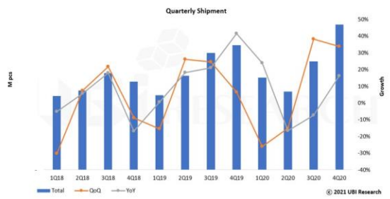
Quarterly Small OLED Display Market Track, 1Q2021 © 2021, UBI Research. All rights reserved. 6