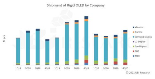
Quarterly Small OLED Display Market Track, 1Q2021 © 2021, UBI Research. All rights reserved. 104