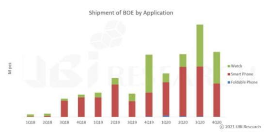
Quarterly Small OLED Display Market Track, 1Q2021 © 2021, UBI Research. All rights reserved. 36